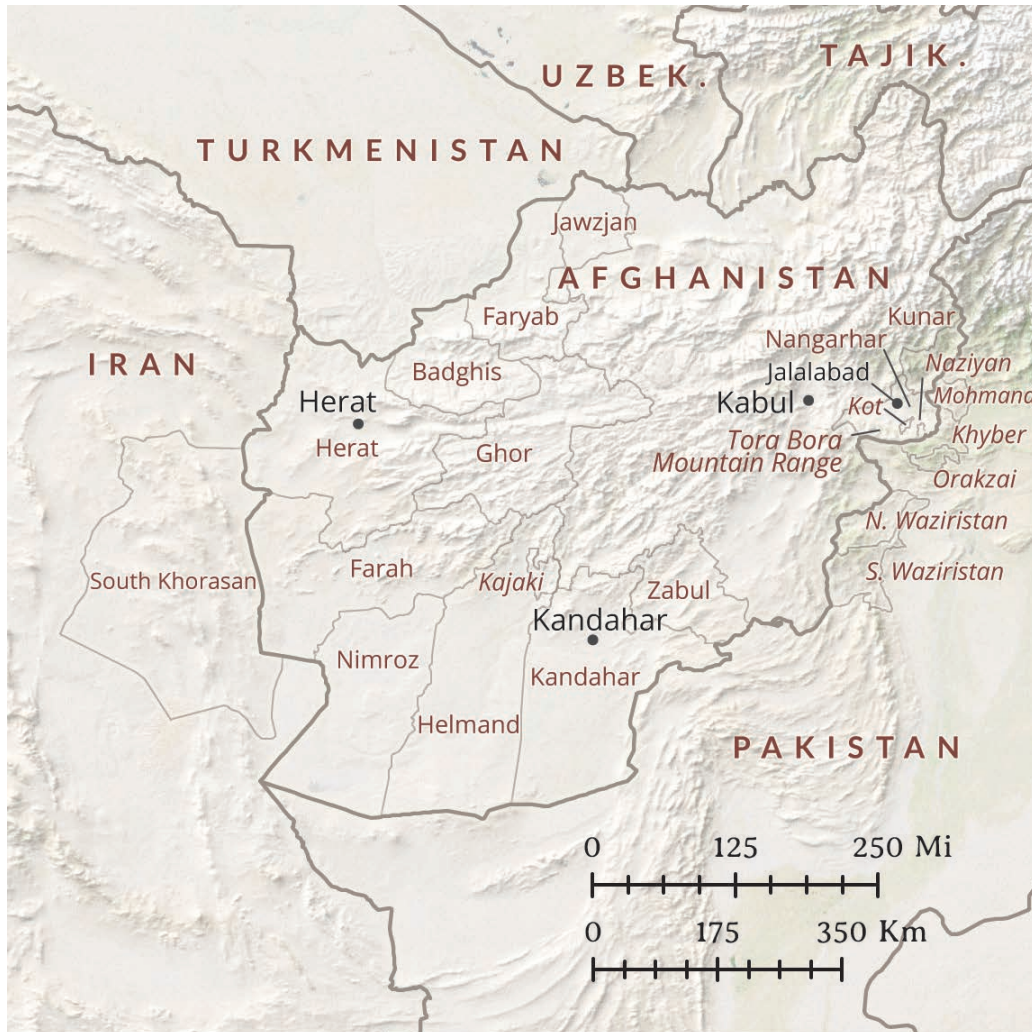
Afghanistan (Rowan Technology)

garhar provinces where the Taliban reap windfall profits from the area's poppy cultivation. 6