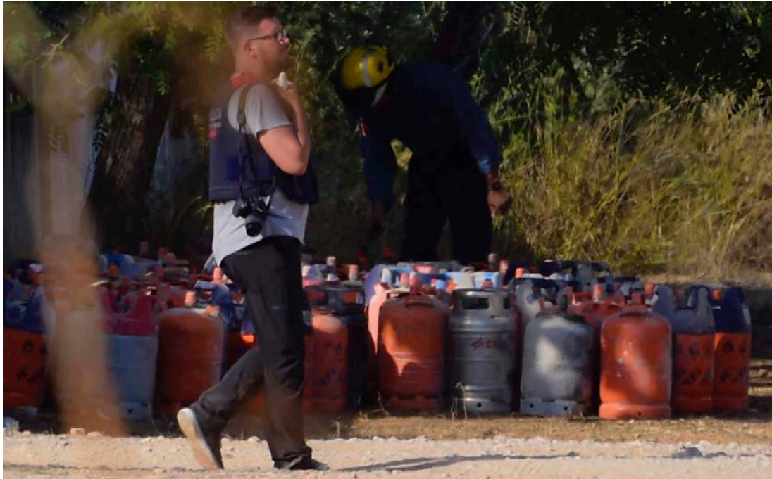
A policeman walks past gas bottles in Alcanar, Spain, on August 18, 2017, during a search linked to the Barcelona and Cambrils attacks.