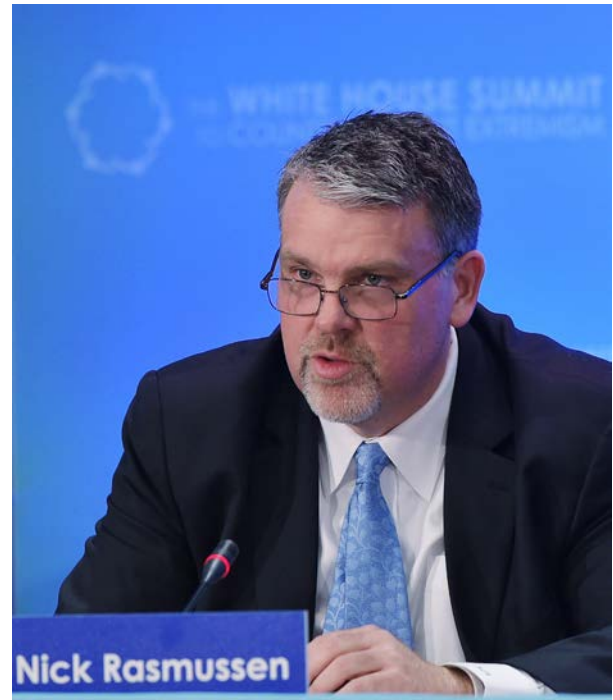
Then Director of the National Counterterrorism Center Nicholas Rasmussen speaks at the White House Summit to Counter Violent Extremism at the State Department on February 19, 2015, in Washington, D.C.

Rasmussen: Yes. In one respect, yes. I'm often asked the question "does this make it harder to gain [the] kind of, international cooperation of the sort we need to carry out our counterterrorism activities?" And there, I'm much more confident the work we are doing