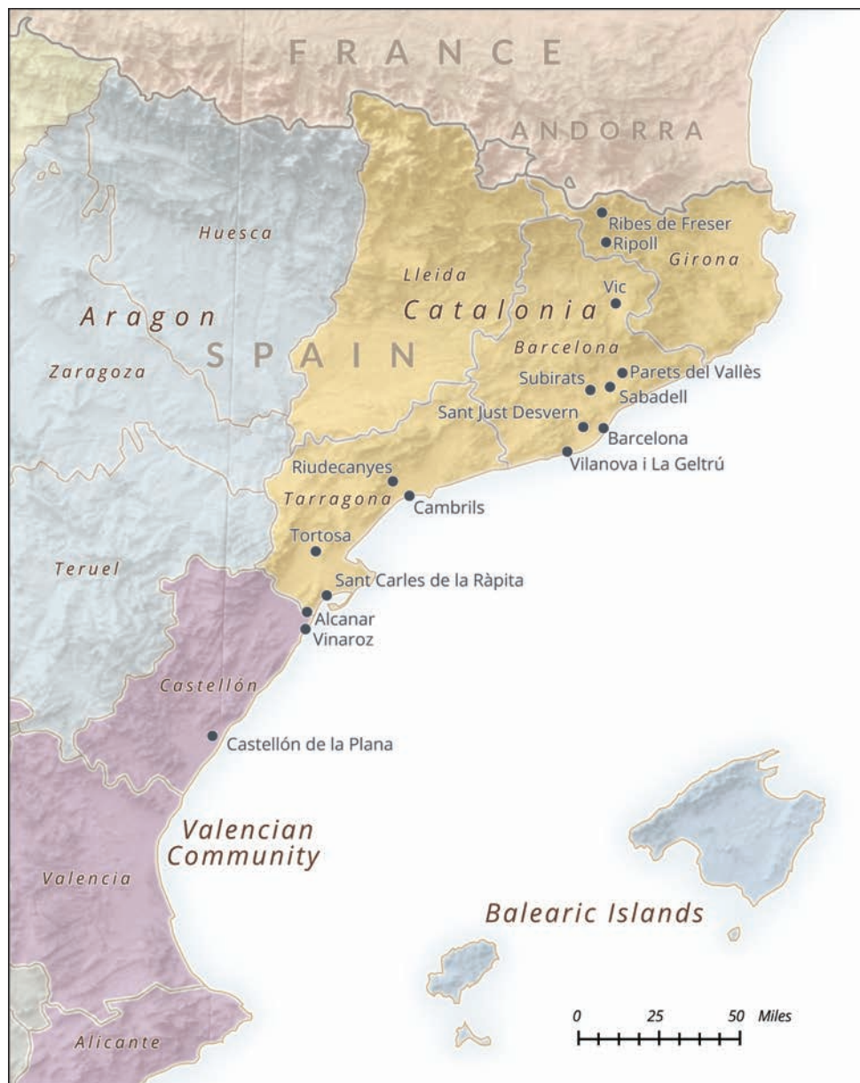
Northeast Spain (Rowan Technology)