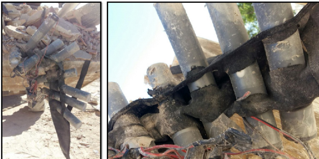
The viable suicide vest found in the rubble at the cell's Alcanar bomb factory. Photographs from different angles obtained by the authors from investigators.