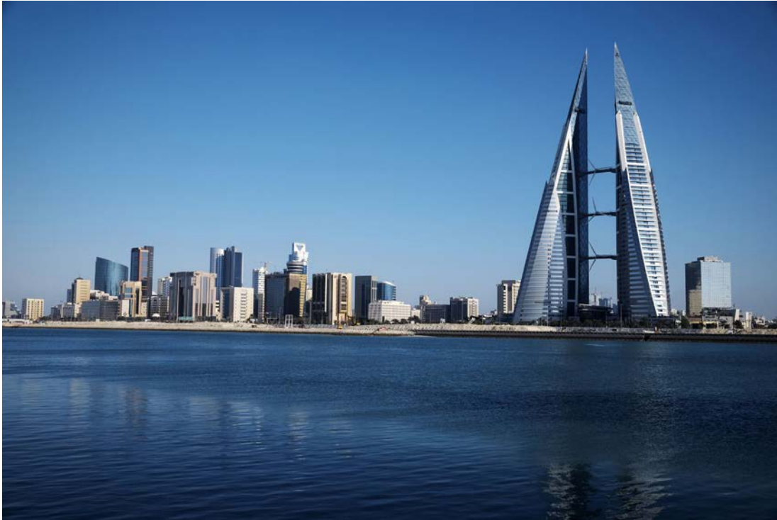
Manama, Bahrain, in 2016